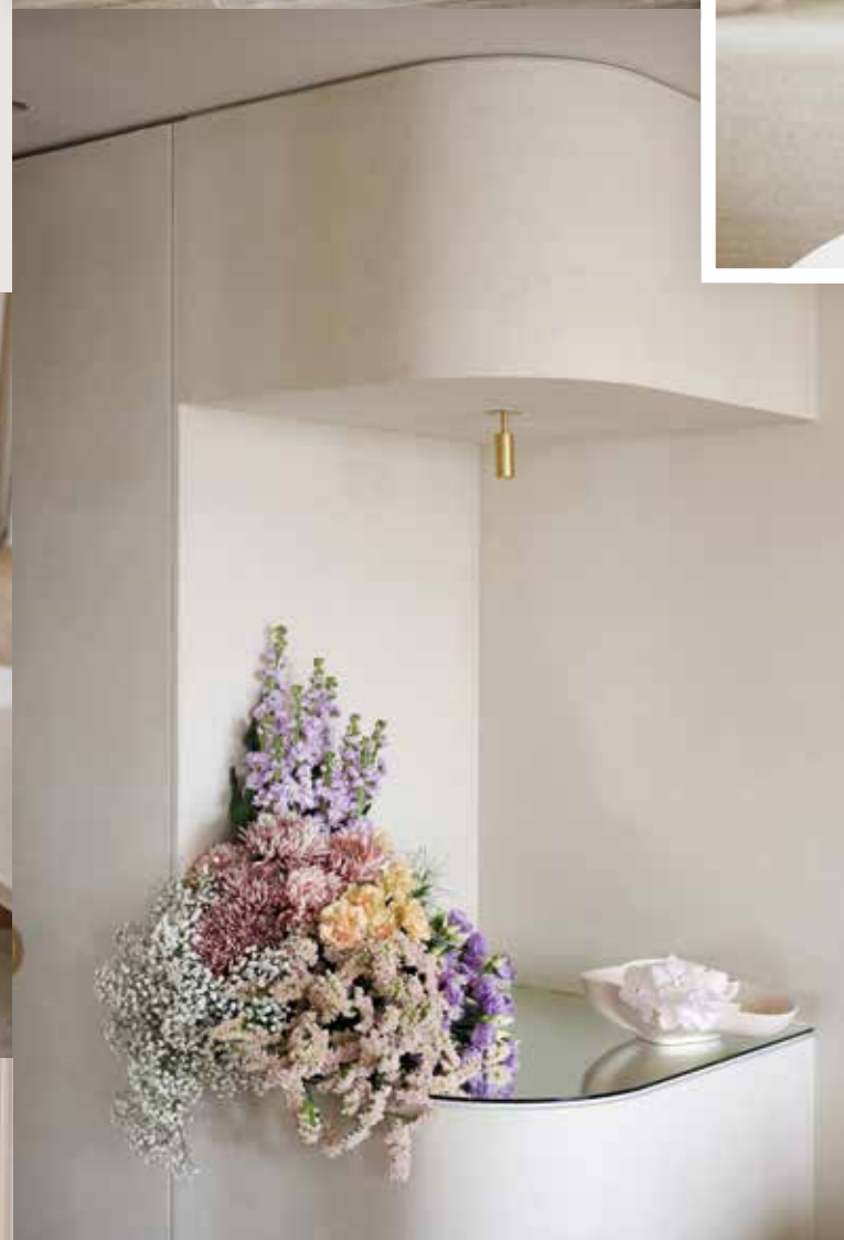
Arrangements that cover the hard edges in the room like a soft cloud.