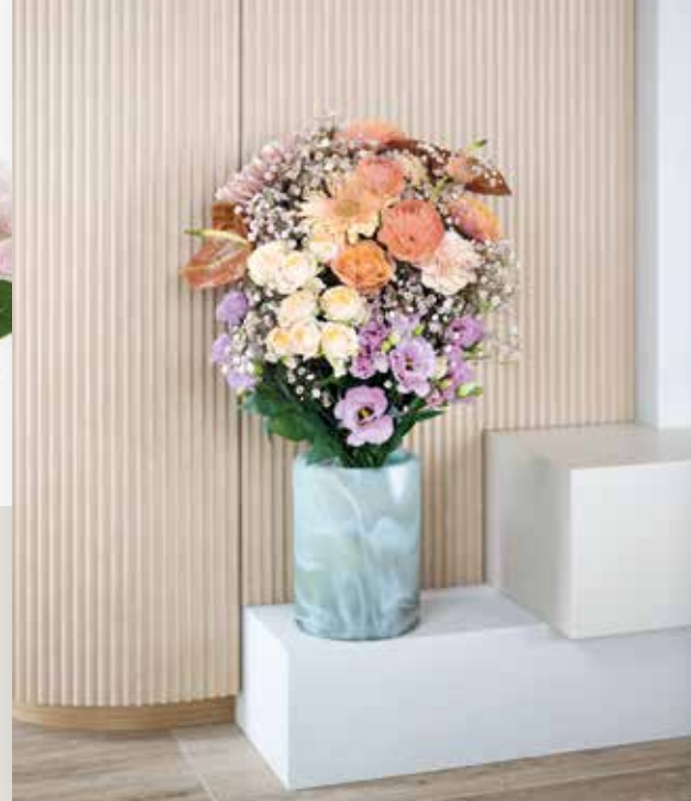
Soft pastel shades for both the room and the bouquet.

For the garden, soft and fluffy grasses are interchanged with denser plants. When it comes to flowering plants, the colours as well as the flower shapes are soft.