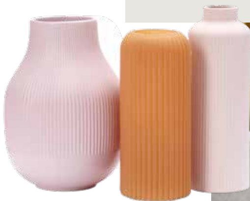
Soft rounded shapes for the vases and floral arrangements.