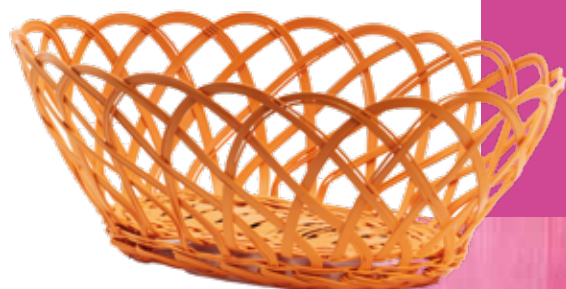
SMALL BASKET POLSPOTTEN

The colours used for the flower arrangements are expressive and celebratory. Lots of differently shaped flowers are used. They may be large, overflowing bouquets, but just one striking flower is sometimes enough to appeal to the imagination, particularly if it is presented as a showpiece. This trend is also helping to give flowering house plants a fashionable image once again. Flowers and plants for the garden tend to have a tropical appearance.